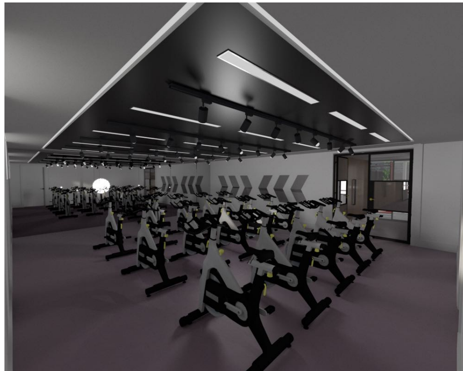
V.08 - STUDIO VIEW 01