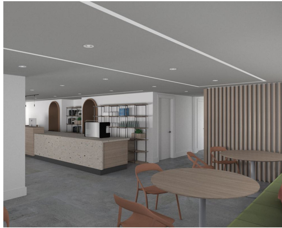
V.06 - SEATING VIEW 03