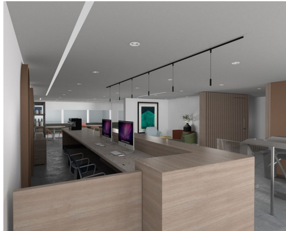
V.01 - RECEPTION VIEW 01