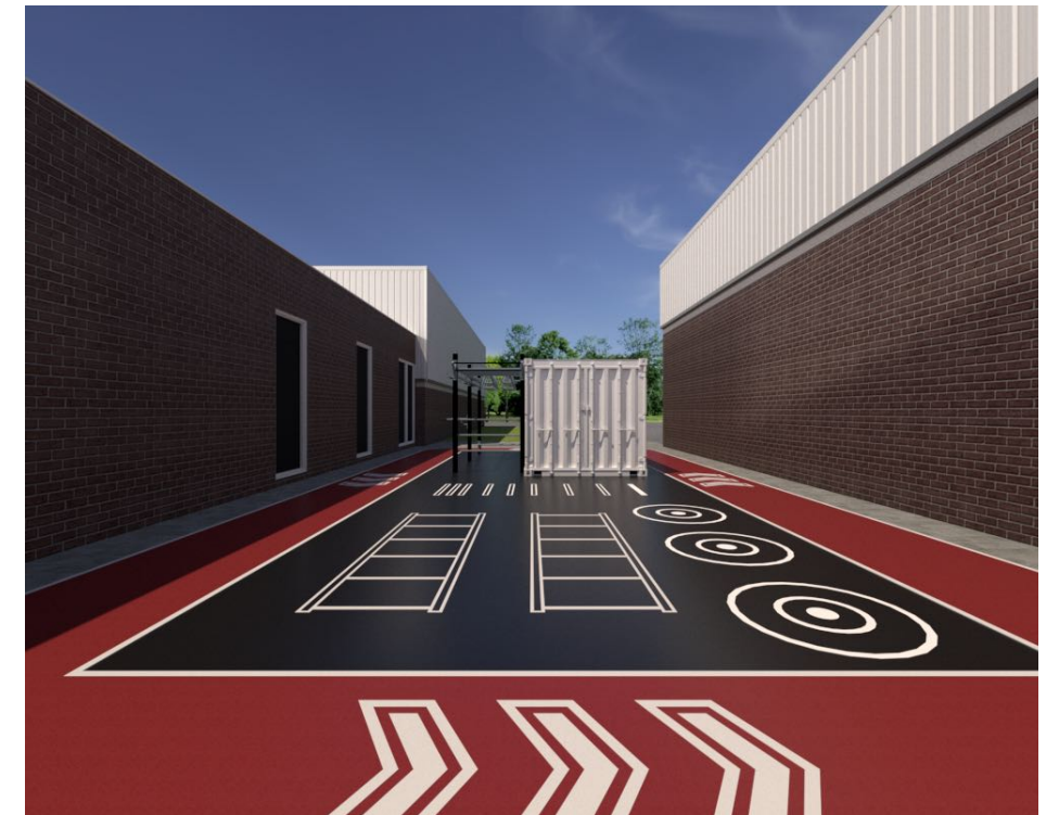
V.10 - COURTYARD VIEW 01