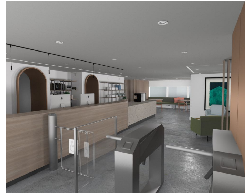
V.02 - RECEPTION VIEW 02