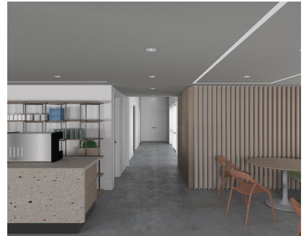
V.05 - SEATING VIEW 02