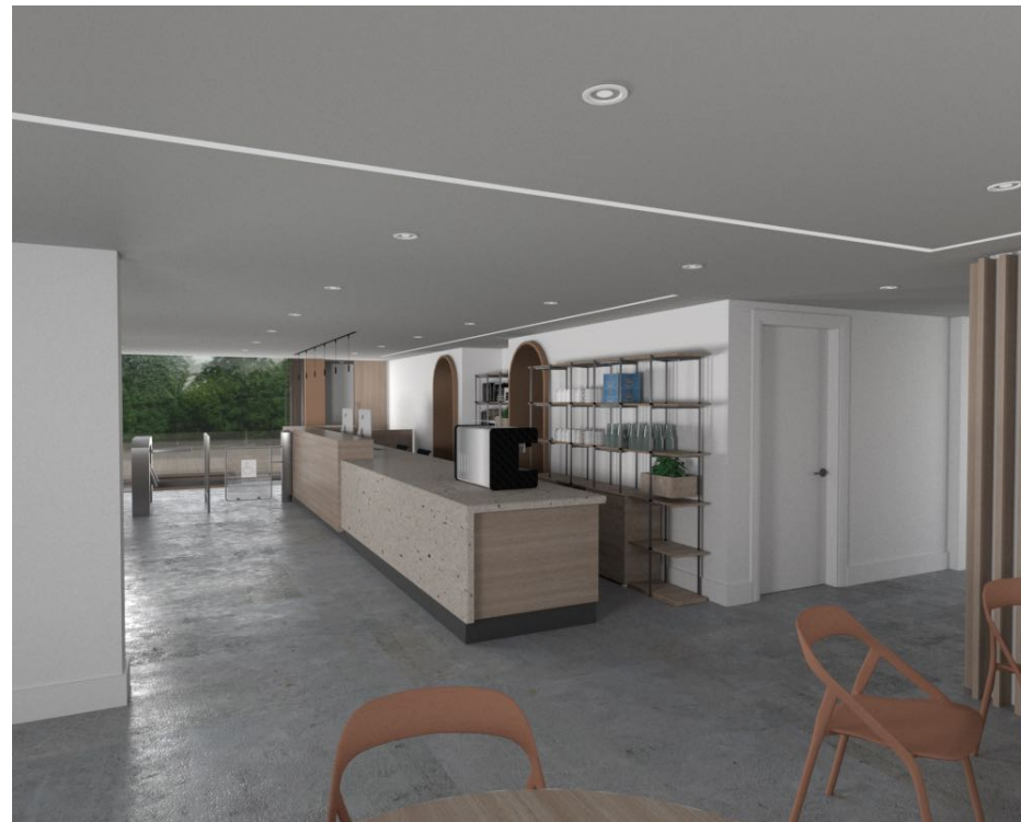
V.04 - SEATING VIEW 01