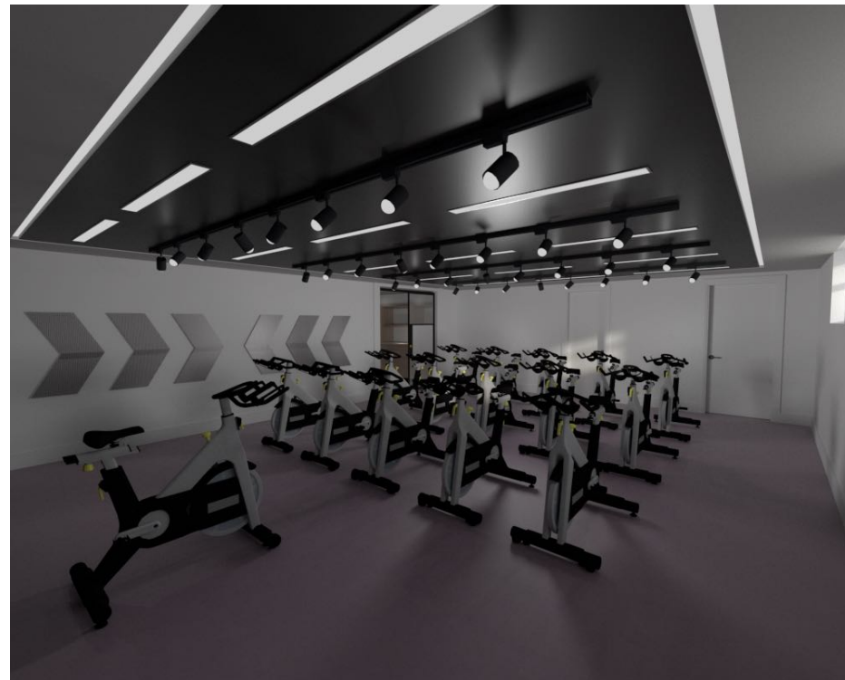
V.09 - STUDIO VIEW 02