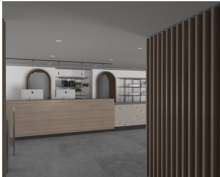
V.03 - RECEPTION VIEW 03